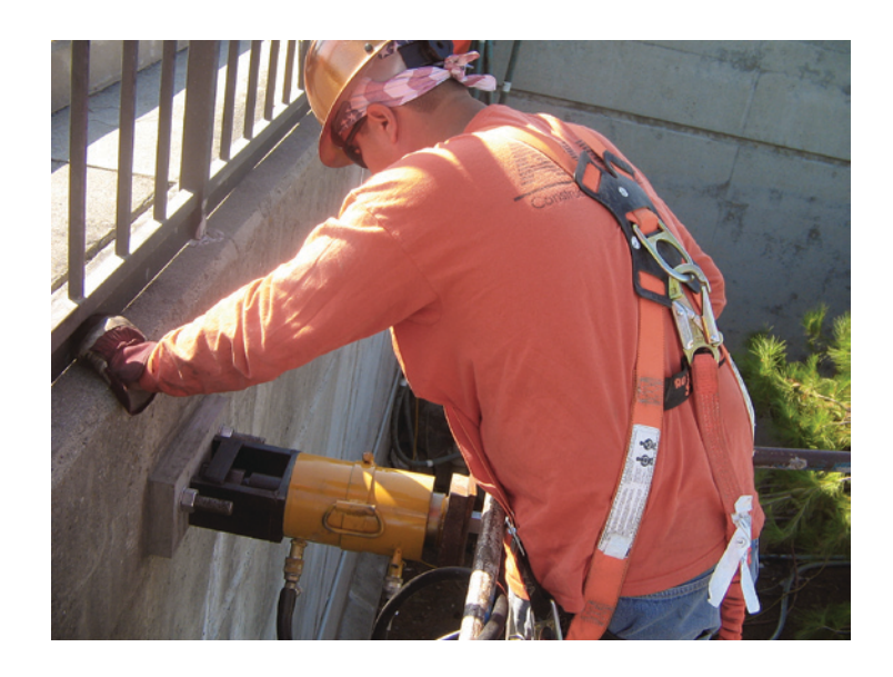
Seismic retrofit of pedestrian overcrossing using SAS Rock Bolts

For SP bolts the bars are protected against corrosion by epoxy coating the thread bar per ASTM A 934 or by using a fast curing polyester resin grout.